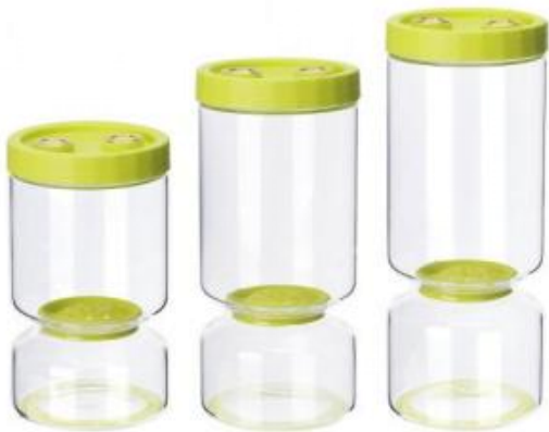
01 Basic Model