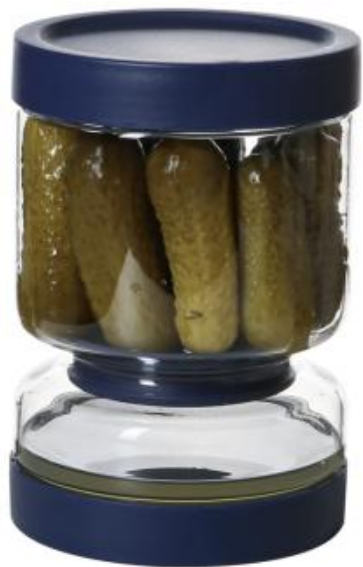
04 Larger diameter with two lids