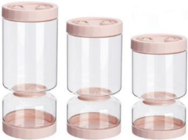
02 Two Lids Model

The lids on both sides can be opened, making it more convenient for cleaning.