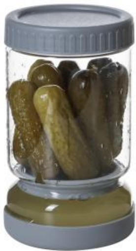
05 smaller diameter