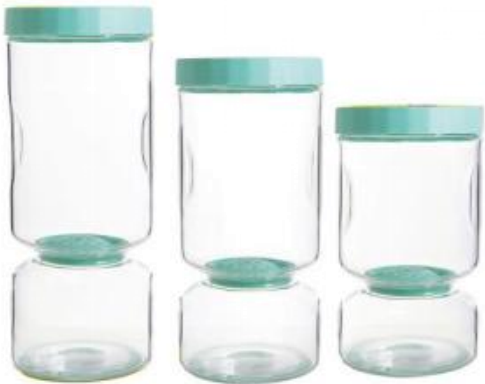
03 Groove handles Model

The lids on both sides can be opened, making it more convenient for cleaning.